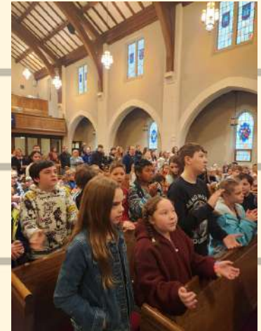
We were so blessed to be joined by "Impact" Wednesday at Chapel. Impact is a musical group from Valley Lutheran High School, and they were amazing!!