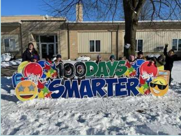
100 DAYS OF LEARNING