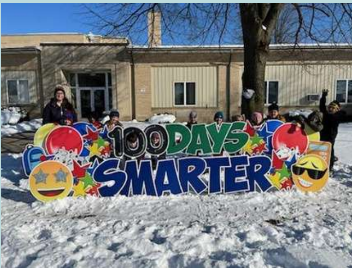
100 DAYS FLEW BY