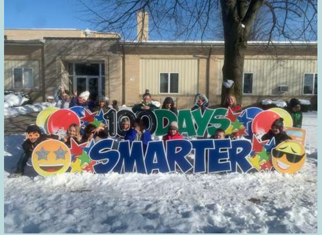
100 DAYS SMARTER