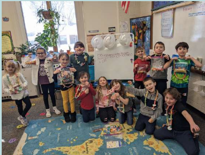
MRS. PRIEM'S CLASS SHOWS OFF THEIR 100 ITEMS