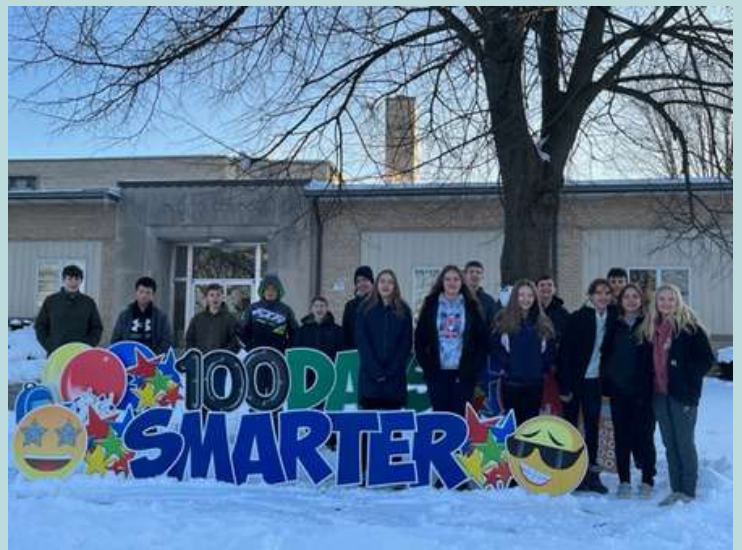
100 DAYS WITH FRIENDS